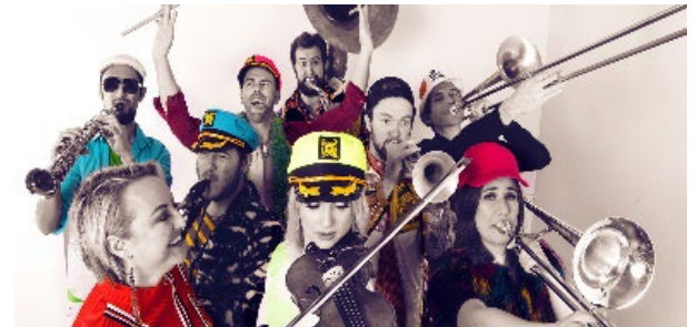
Bay Area Music Collective Jazz Mafia