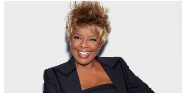
Grammy Award Winning Artist Thelma Houston