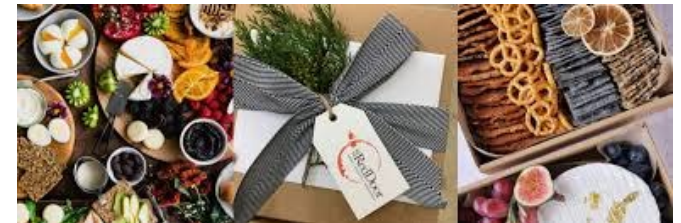
Great Food, Beverages, and Exciting Silent Auction Items